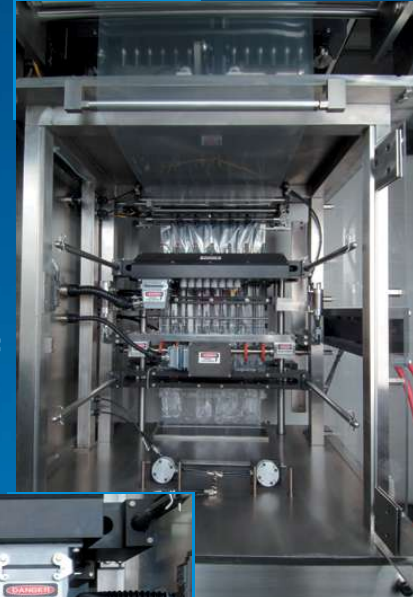
Quick-disconnect knife assembly.

1019 Cedar Lake Road, S.E. • Decatur, AL 35603 USA Telephone: 256-350-4241 • Fax: 256-350-1611 Email: sales@ropak.com • Web: www.ropak.com