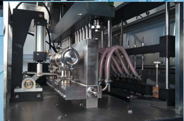
Fill system is sanitation-friendly with easy adjustments.